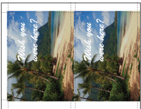
2-up 5" x 7" postcards Optional FC-10 - 7" Cassette