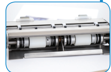
Heavy-duty cutting cassettes are interchangeable in seconds