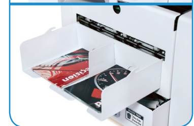
Adjustable catch tray keeps cards neatly stacked