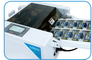
Automatic friction feed system and interlocking plexi cover