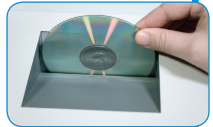
Optical media infeed