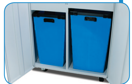
Lifetime guaranteed waste bins made of heavy-duty molded plastic

Formax - New Hampshire, USA www.formax.com