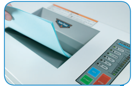
Separate infeed for paper, and user-friendly LED control panel

* Paper Shredder is designed ONLY for paper. No CDs, DVDs, Blu-ray discs, credit cards, staples, or paper clips.